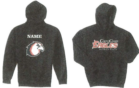
Pullover Hooded Sweatshirt Youth and Adult Sizes Personalization Available