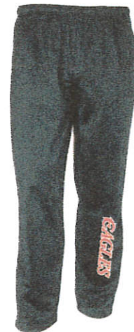
Tricot Activewear w/Leg Zippers Logo on lower leg Adult and Youth Sizes