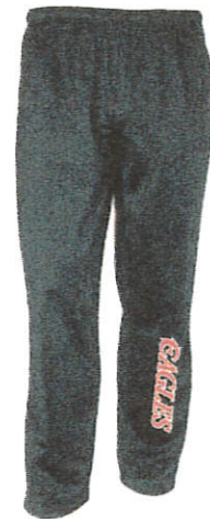
Tricot Activewear w/Leg Zippers Logo on lower leg Adult and Youth Sizes