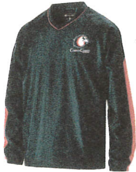
Windbreaker Jacket Water & Wind Resistant Youth and Adult Sizes