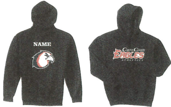
Pullover Hooded Sweatshirt Youth and Adult Sizes Personalization Available