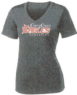
Moisture Wick T-shirt Ladies Cut v-neck Short Sleeve Adult Sizes