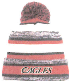
Winter Beanie Hat Acrylic Shell w/ Fleece Lining