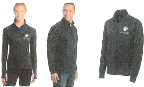
1/4 Pullover & Full Zip Fabric: Moisture Wicking Technology Mens and Ladies Sizes