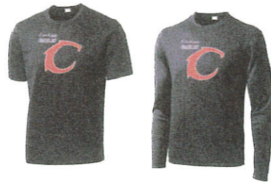
Moisture Wick T-shirt Standard Cut short sleeve and long sleeve Youth and Adult Sizes Personalization Available