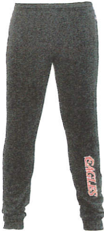
Jogger Pants Logo on lower leg Adult Sizes Only