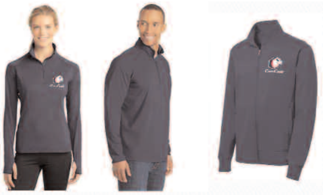
1/4 Pullover & Full Zip Fabric: Moisture Wicking Technology Mens and Ladies Sizes