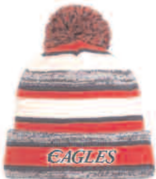
Winter Beanie Hat Acrylic Shell w/ Fleece Lining