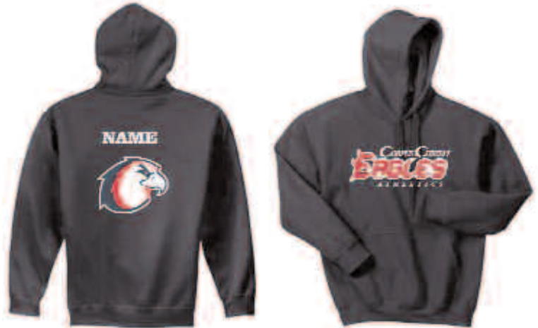
Pullover Hooded Sweatshirt Youth and Adult Sizes Personalization Available