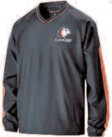
Windbreaker Jacket Water & Wind Resistant Youth and Adult Sizes