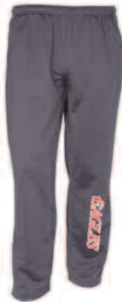
Tricot Activewear w/Leg Zippers Logo on lower leg Adult and Youth Sizes