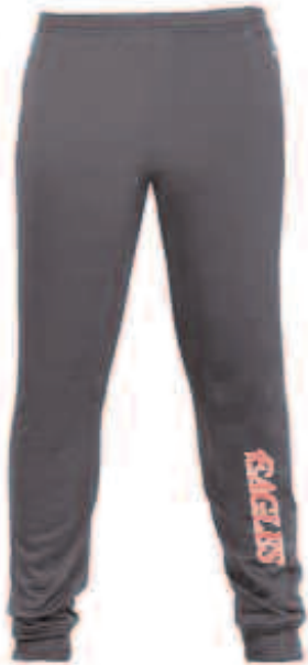
Jogger Pants Logo on lower leg Adult Sizes Only