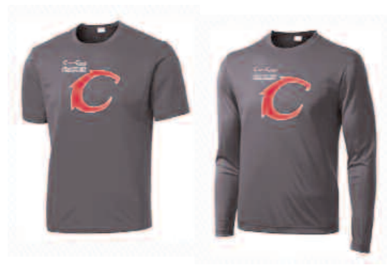
Moisture Wick T-shirt Standard Cut short sleeve and long sleeve Youth and Adult Sizes Personalization Available