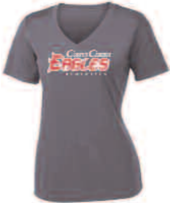
Moisture Wick T-shirt Ladies Cut v-neck Short Sleeve Adult Sizes